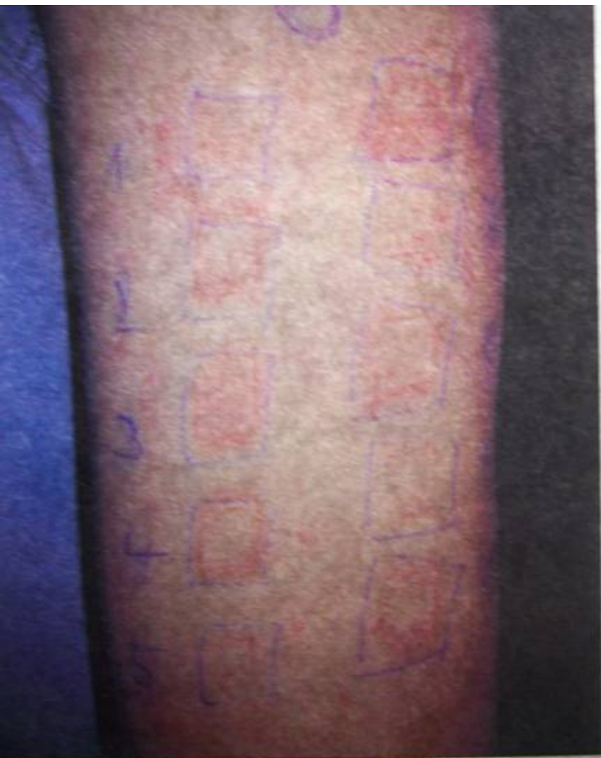
Elemente / Hautstoffe